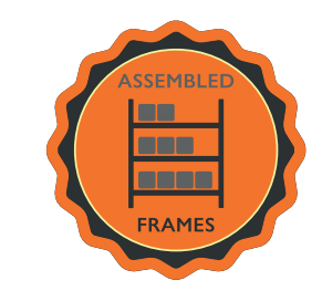
Available in all sizes